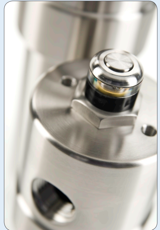
The SiS series housings feature a visual indicator